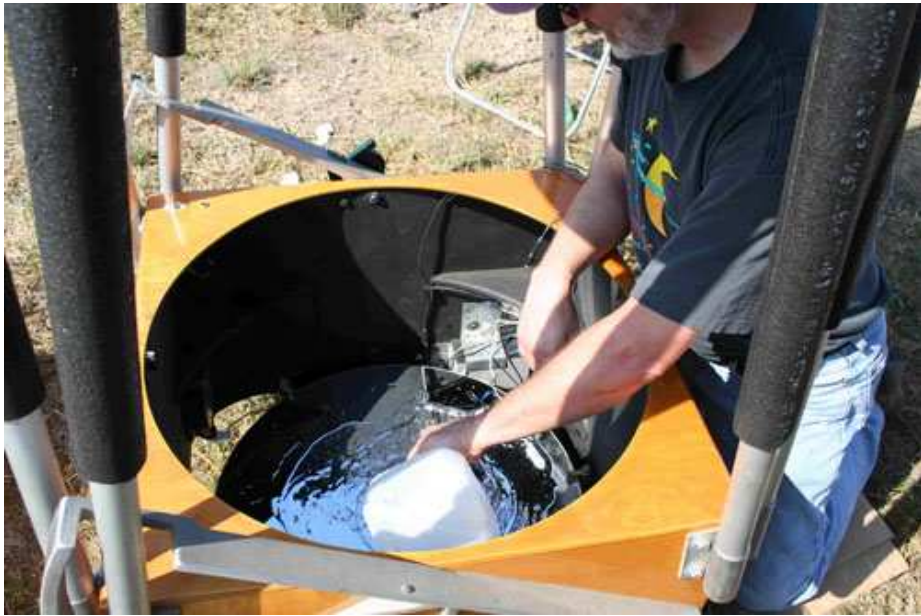
6) Rinse the mirror with distilled water.